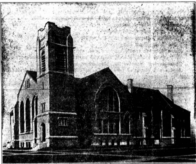
EXTERIOR OF CHURCH.

They cannot profit by an exercise in the expression of thought if they have no thoughts to express. Composition is the production of the form, but form can come into existence only as the embodiment of the results of mental operations. With young pupils the object lesson is a useful exercise preliminary to essay-writing; those more advanced may be profitably asked to write on themes taken from literature, history, or science. No matter what the topic