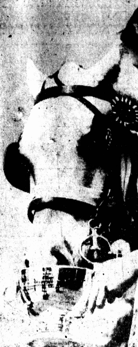
Princess Elizabeth with her pony "Hans," and the silver cup which she won at the Royal Horse Show at Windsor.