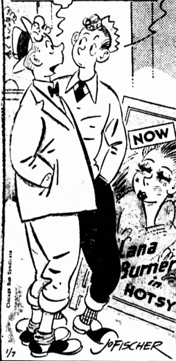
and SUMMER HOTSY

OH BOY! THIS HOLLYWOOD CHICK SURE FILLS MY PRESCRIPTION! SALLY SLOPSOX DIMPLES A CUTE PAIR OF D'INGAREES HERSELF!