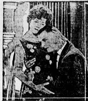
The ABYSMAL BRUTE Starring REGINALD DENNY A UNIVERSAL JEWEL