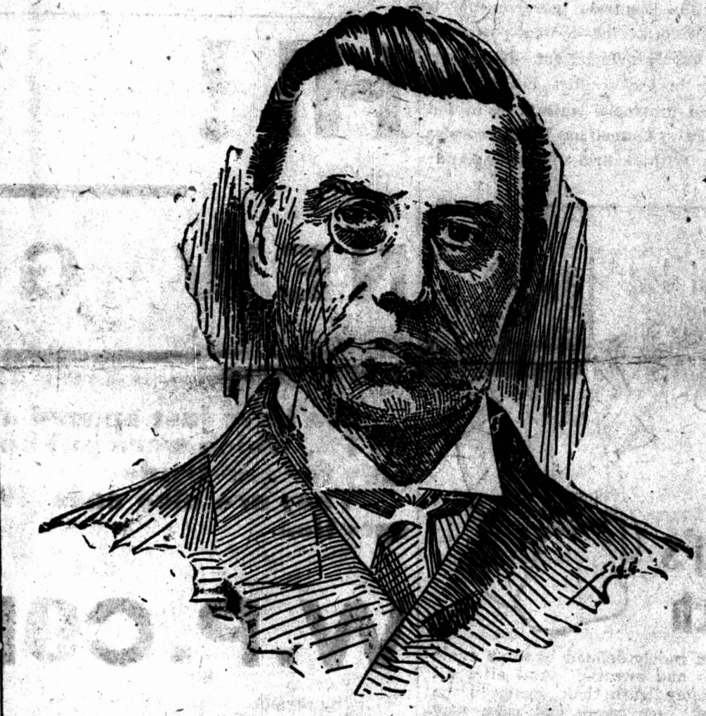
Right Hon. Joseph Chamberlain.

Anti British Feeling Aroused By His Utterances And People Want Him Muzzled.