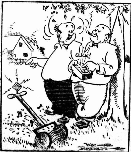
"Gee! I hope my wife will let me get one with a Guardian Want Ad, too!"