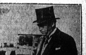
Prime Minister B. H. Bennett leaving his hotel in London, from where he has just returned, for a meeting of the privy council at Buckingham palace.