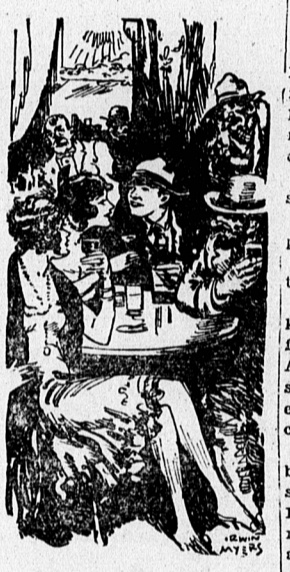
The Place is Packed With Rowdy Men and Ribald Women.

rowdy men and ribald women. I am at the zenith of my shame. Right and left I am buying wine. How I loathe myself but I think of Berna, and the thought goads me to fresh excesses. I will go on till flesh and blood can stand it no longer, till I drop in my tracks. I realize that somehow I must make her pity me, must awake in her that guardian angel which exists in every woman. Only in that way can I break down the barrier of her pride and arouse the love latent in her heart. Always amid that lurid carnival of sin floats the figure of Blossom, Blossom with her child-face of dazzling fairness, her china-blue eyes, her round, smooth cheeks. How different from the pinched pallid face of Berna! Poor poor Berna! I never