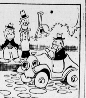
NEW ATTACHMENTS "Has he any new attachments on his car?" "Yes; almost as many as he has lefts."