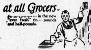
at all Grocers.

For years you have been expecting KING COLE Coffee—you wanted it—even asked your grocer for it—just because you liked KING COLE TEA. You will demand much of KING COLE Coffee—it must be different—more fragrant—more satisfying. You expect all that and more. The same skill and care that have made the reputation of KING COLE Tea have been at work on Coffee too—and we are confident you will be pleased with the result.