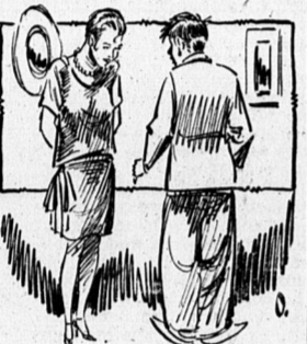
A FITTING CELEBRATION "I believe 1928 is a leap-year, isn't it?" "Sure, and I'm laying in a big supply of Hops you can bet."