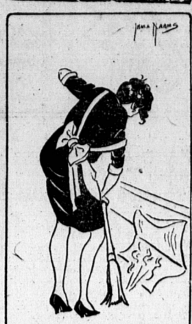
"When cremation becomes more popular probably a dust pan will replace the skeleton in the closet."