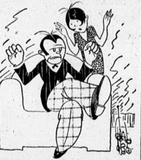
"Wife: Are you swearing off anything? Hubby: No—just swearing."