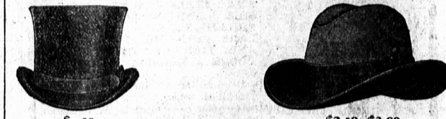
$5 00 $2 50 $3 00

Franslin Hats $3 00 $2 00, $2 50 and $3 00