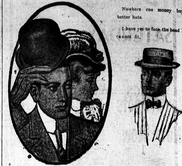
Nowhere can money buy better hats. I have yet to face the head I cannot fit.

Franslin Hats $3 00 $2 00, $2 50 and $3 00