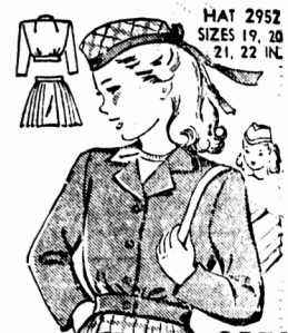
HAT 2952 SIZES 19, 20, 21, 22 IN.

Little lassie's will love this ensemble — in a partnership of plaid and plain fabrics! No. 2373 pairs a pleated skirt with a jaunty jacket that can be cut with or without the fitted waistband. No. 2952 makes a Scotch hat to complete the costume. No. 2573 is cut in sizes 4, 6, 8, 10 and 12. Size 8 skirt, 1 1/2 yards 54-inch; jacket, 1 1/4 yards 54-inch. No. 2952 is cut in head sizes 19, 20, 21 and 22. Size 20, 1/2 yard 18-inch. Send 20¢ for each PATTERN which includes complete sewing guide. Print your Name, Address and Style Number plainly. Be sure to state size you want. Include postal unit, or zone number in your address. Address: Pattern Department, The Charlottetown Guardian, Pattern No. 2373 and No. 2952