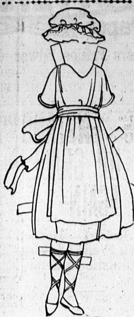
A SAD FAREWELL

This is one day's chapter of 'Snow-White and Rose Red.' Are you saving these paper dolls? If you do, at the end of two weeks you will have a whole set of characters with which to act out this lovely story.