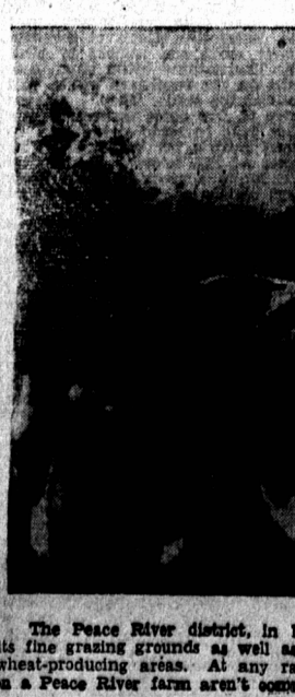
The Peace River district, in Northern Alberta, is well-known for its fine grazing grounds as well as for being one of Canada's greatest wheat-producing areas. At any rate these three calves photographed on a Peace River farm aren't complaining.