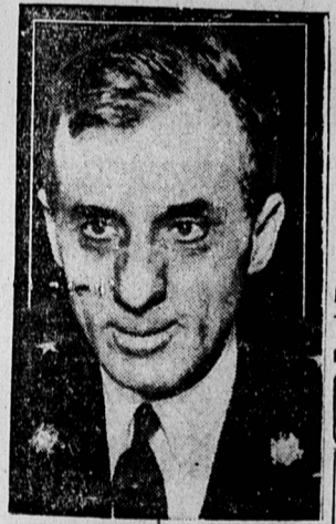
Maj.-Gen. Smedley D. Butler, former commandant at Quantico, Va., marine base, and now technically under arrest there, whose pending court-martial, as a result of a Philadelphia speech in which he is alleged to have passed unfavorable remarks about Premier Mussolini, is causing a sensation in army and navy circles.