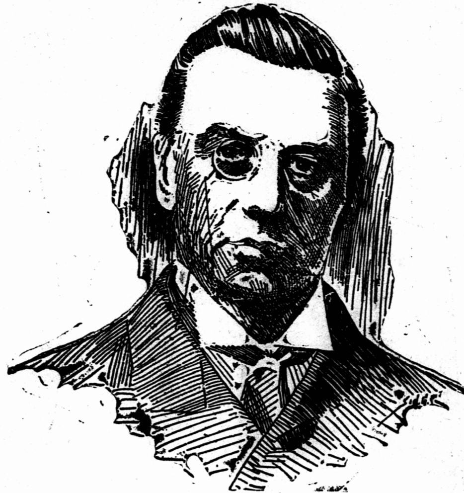
HON. JOSEPH CHAMBERLAIN,

Now on his way to South Africa to inquire into the conditions there.