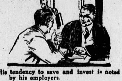
His tendency to save and invest is noted by his employers.