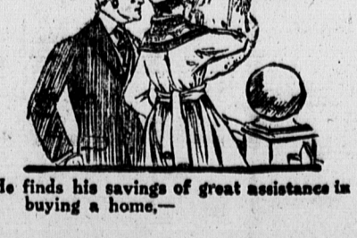
He finds his savings of great assistance in buying a home.