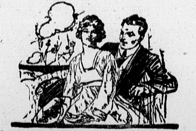
He improves the shining hour and impresses upon an important person that he is in possession of an "estate."