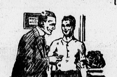
He takes his first step in business affairs, is examined by the doctor, and creates an estate of $5,000.