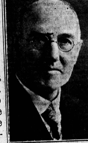
HON. A. C. SAUNDERS, The New Premier