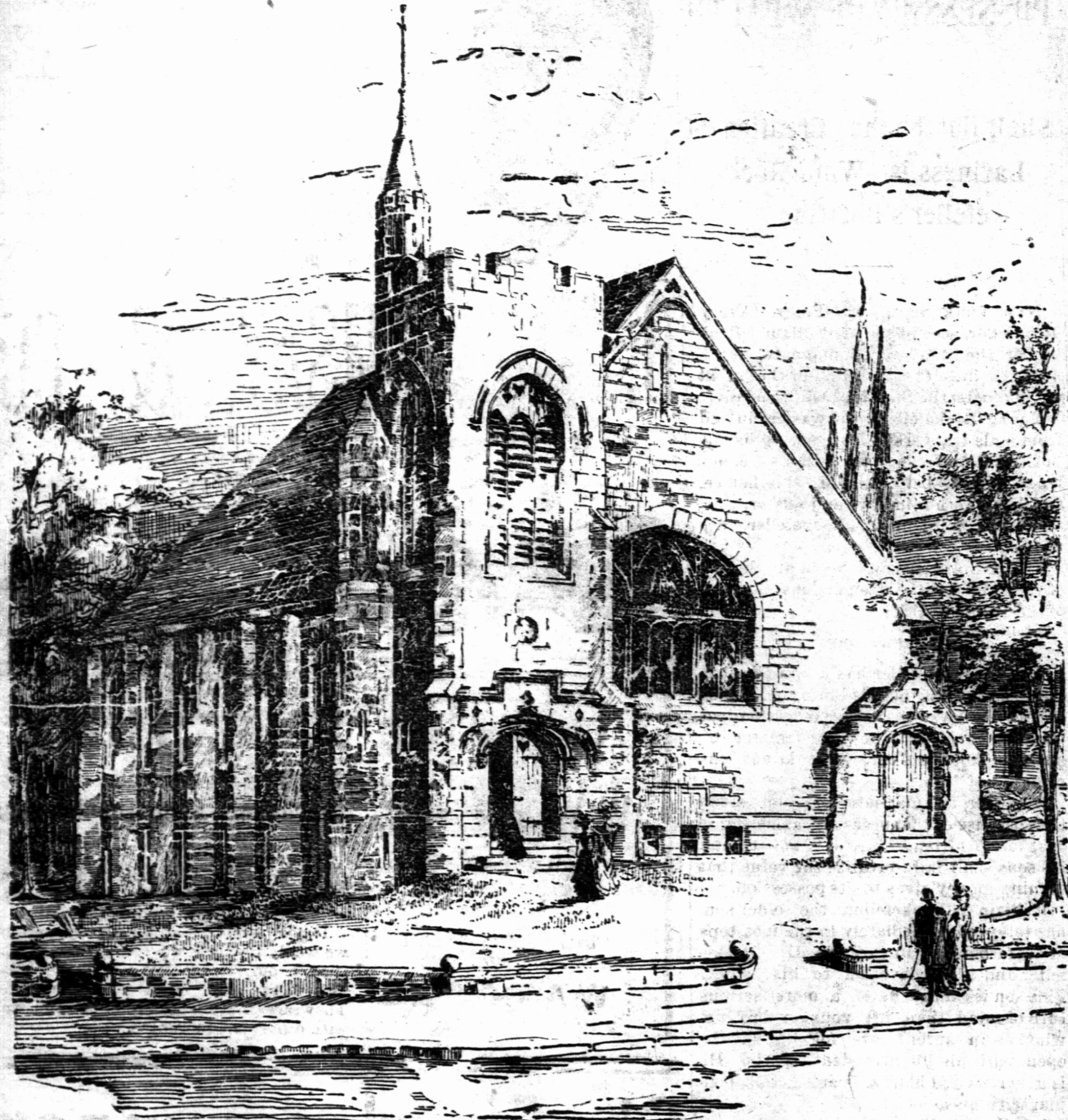
THE PRESBYTERIAN CHURCH IN ERECTION AT VANKLEEK HILL

A 5 cent plug of "Patriot" Twist chewing tobacco is 20 per cent larger than formerly