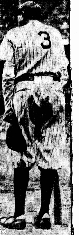
It was a sick and lean Ruth that put on once again the famous number three uniform on a day honoring him in Yankee Stadium 13 years after he had returned from baseball.