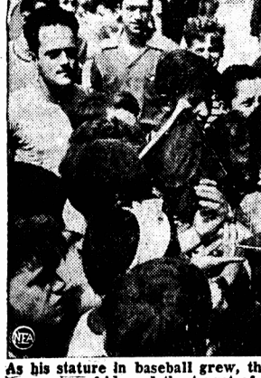
As his stature in baseball grew, the Bambino became the idol of kids and the target of autograph seekers.