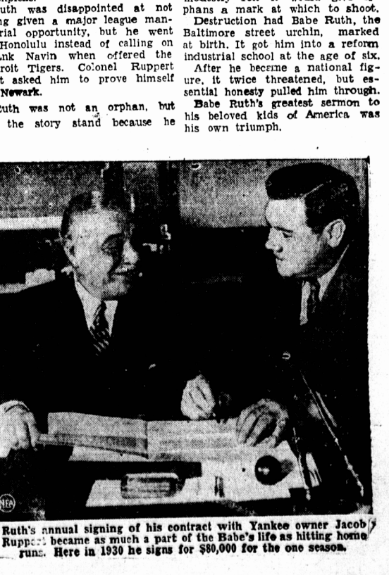
Ruth's annual signing of his contract with Yankee owner Jacob Ruppert became as much a part of the Babe's life as hitting home runs. Here in 1939 he signs for $80,000 for the one season.