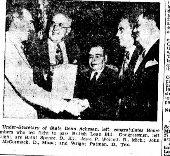
Under-Secretary of State Dean Acheson, left, congratulates House members who led fight to pass British Loan Bill. Congressmen left to right are Brent Spence, D. Ky.; Jesse P. Wolcott, R. Mich.; John W. McCormack, D. Mass.; and Wright Patman, D. Tex.