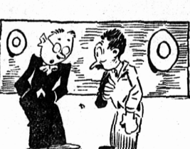
THEY'RE SO LIGHT "Why do you prefer blondes?" "You can see 'em better in the dark."