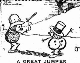
A GREAT JUMPER Bug: I hear, Mr. Grasshopper, your most important witness has appeared. Cop Bug: Yes, he jumped his bit!