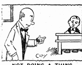
NOT DOING A THING Prof. (conducting exam.): Jones, what is that book doing under your desk? Stude (staring closely at book): It's not doing a thing, sir, that I can see.