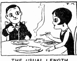
THE USUAL LENGTH Newlywed (at table): You cooked this spaghetti too long. Mrs. N.: I assure you it's the usual length, dear.