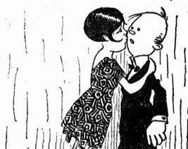
She: George, you're the coldest man I ever knew. You're like an iceberg. He: What do you want me to do—melt and run all over the place?