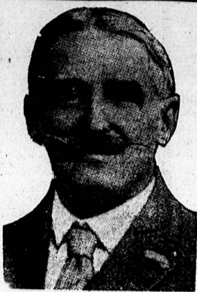
HON. F. R. HEARTZ Lieutenant Governor of Prince Edward Island, who formally opens the Fox Show