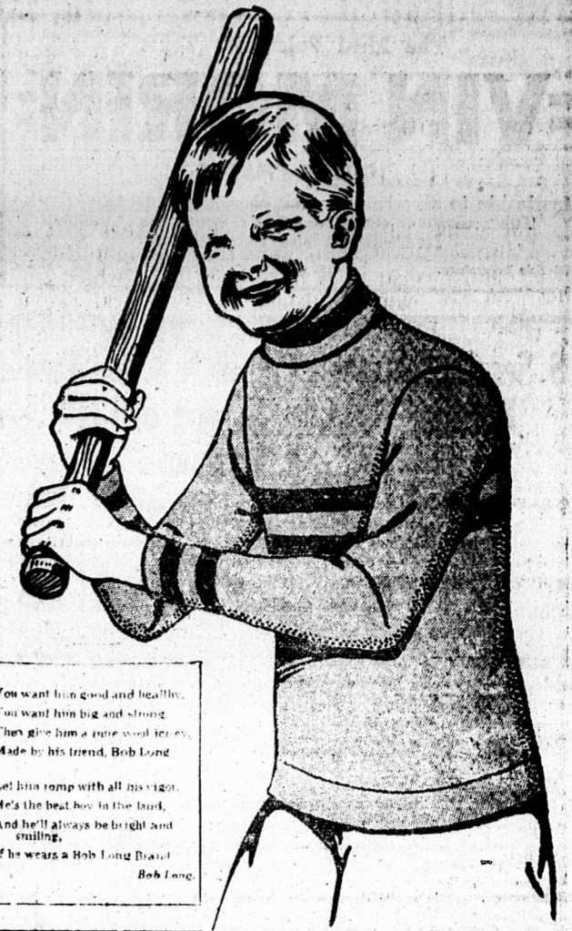
You want him good and healthy. You want him big and strong. Then give him a pure wool jersey. Made by his friend, Bob Long. Let him romp with all his toys. He's the best boy in the land. And he'll always be bright and smiling. If he wears a Bob Long Brand Bob Long.