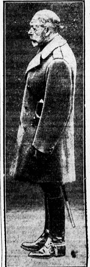
HIS MAJESTY KING GEORGE V.