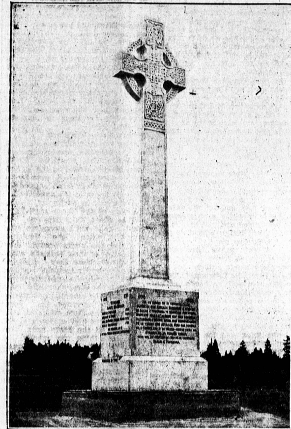
THE SCOTTISH MEMORIAL TO BE UNVEILED TODAY AT SCOTCHFORT

LONDON, July 18.—Startling revelations are expected next week when the Board of Inquiry ordered by the British Government into the sinking of the liner Egypt is opened. The Egypt foundered off Cape Ushant with the loss of ninety five lives and ever since that date there have been rumors of panic and serious allegations of cowardice against the alien seamen in the crew. The disgraceful scenes that occurred at the time were at first alluded to in whispers, but now they are the subject of general discussion.