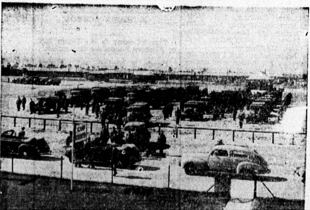
This army moves on wheels — the wheels of 500 army trucks, tanks and motorcycles. Overhead, as the three divisions of the force move toward the coast, will be reconnaissance planes. This is the busy scene at army headquarters before the big march begins.