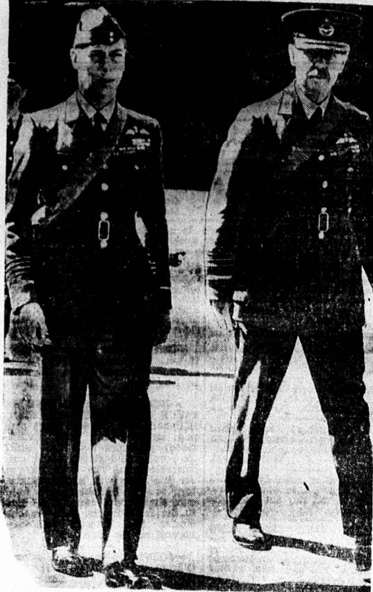
Air Marshal Sir Hugh Dowding, chief of the R.A.F. fighter command, which has played a foremost part in the defence of Britain from air attack, has been made a Knight Grand Cross of the Military Division of the Order of the Bath. Known as "Stuffy" by his pilots, who idolize him, the fighter chief was chiefly responsible for putting eight synchronized machine-guns in Spitfires and Hurricanes, twice as many as Nazi fighters carry. The King appears with him in this picture during an inspection tour.