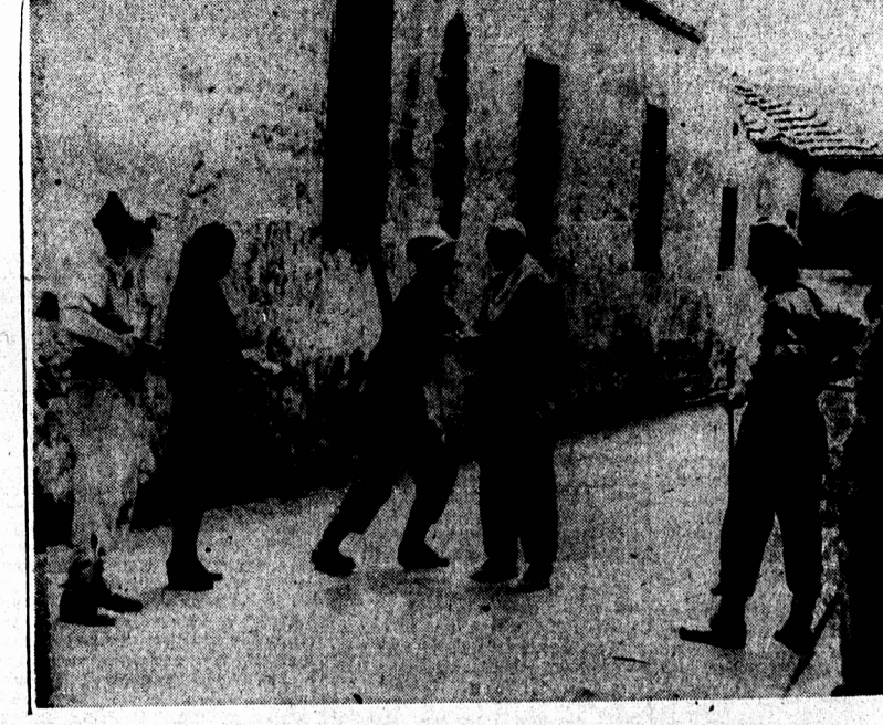
This is one of the first pictures to come out of Haifa, Palestine, since it was seized by the Jews. Barricades were quickly erected by the Jewish Hag anah. The picture shows an Arab couple being searched. Everything was found to be in order and they were allowed to proceed. The only part of the town not held by the Hag anah is the dock area still retained by the British. Most of the Arab population has been evacuated from the city.

WINNIPEG, May 30—(CP)—Oats and barley futures showed a good tone on fair demand by eastern processors during active trade Saturday on the Winnipeg Grain Exchange. May oats reached the new seasonal high of $1.05 1-2, while the other futures scored modest gains. Offerings were liberal but well absorbed. May rye declined the two-cent limit on commission house selling while the July future advanced on a few buying orders. Class two wheat prices were reduced one cent from Friday. Cash prices: Oats: No 2 CW 1.06 1-2; ex 3 CW 3 CW and ex 1 feed 1.02 1-2; 1 feed 1.00 1-2; 2 feed 88 7-8; 3 feed 85 7-8; track 87 7-8. Barley: 1 and 2 CW 6-row, 1 and 2 CW 2-row 1.42 1-4; 3 CW 6-row 1.36 1-4; 1 feed 1.30 1-4; 2 feed 1.15 5-3; 3 feed 1.10 1-8; 2 CW yellow 1.36 1-4; 3 CW 1.34 1-4; track 1.18 1-8.