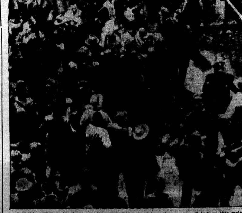
and striking OIO packinghouse workers were being fought as the camera clicked on this melee at the Swift & Co plant in South St. Paul, Minn. Police were attempting to enforce an injunction against National Guard has been ordered into the area.