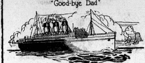
While sailing over the ocean your mind would be at rest