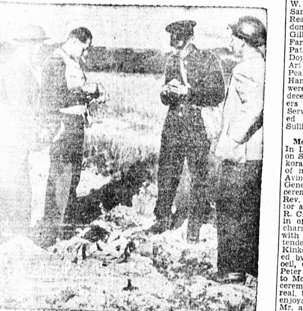
The fallen airman lands in a field near the town, lights up a cigaret while answering questions of an English policeman . . .