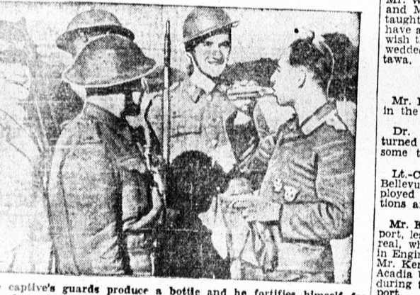
The captive's guards produce a bottle and he fortifies himself for the long days ahead in an English prison camp . . .