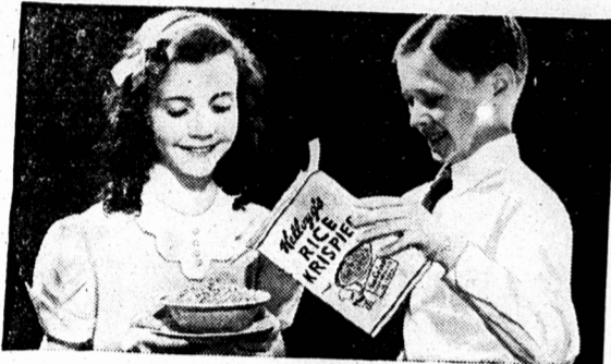
Three days later, Sue wrote back, "Sis, I'm way ahead of you! I serve Kellogg's Rice Krispies - the cereal that crackles - and the kids love it! They're little angels at the table! That was months ago - and they're still little angels (at least when Rice Krispies are served)!"

Children are amused by the "Snap, Crackle, Pop!" of Kellogg's Rice Krispies in milk or cream - soon learn this delightful sound means tempting flavor and crispness that puts an end to mealtime "tantrums!"