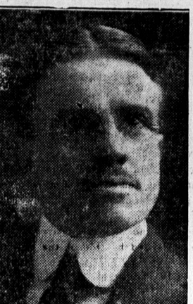
Representing the constituency of Leeds in the New Canadian parliament. His home is in Brockville, Ont.