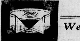
We Sell the W. G. & R. Collars

When you buy collars, isn't it well to be certain that they will fit perfectly, that they will be stylish, and best of all, that they will stand the wear and tear of the laundry. To get all these good qualities you must buy collars that are cut right and made right.