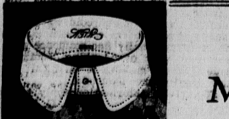
MacLellan Bros The Men's Store.