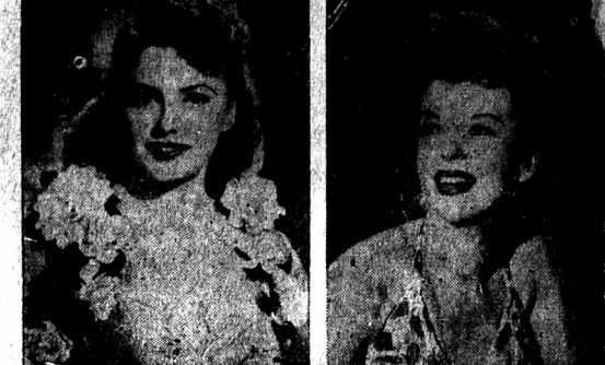
Joan Leslie, Warner Bros. dancing and singing star, has the leading role in "Janie Gets Married."

Earlier this week the league announced award of the Lady Byng trophy to Hector "Toe" Blake of Montreal Canadiens for his sportsmanship coupled with a high standard of playing ability. Another Canadian, Bill Durnan, won the Vezina Trophy as the league's best goal-tender.