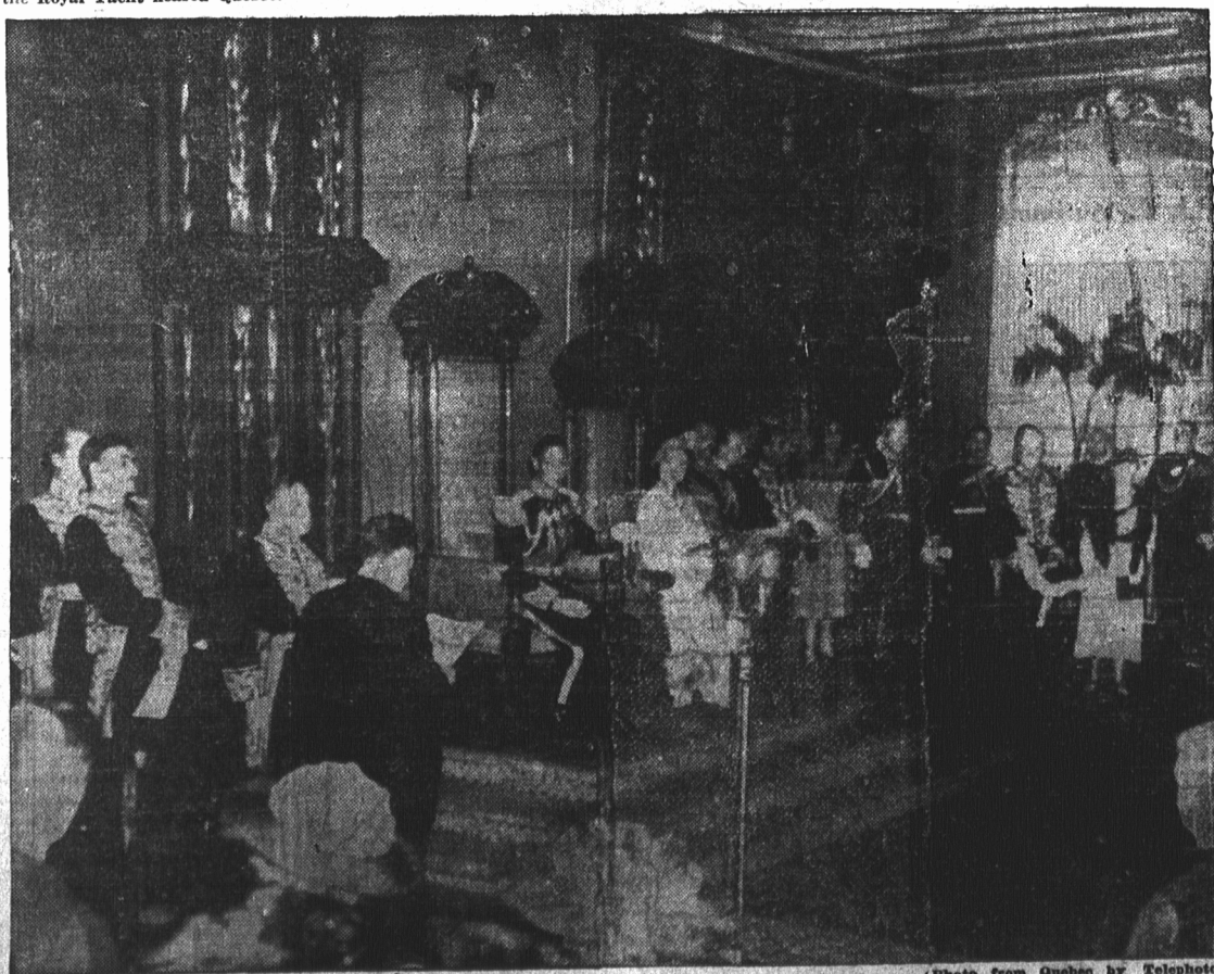
The King and Queen occupy chairs of state in the Quebec Legislative building.