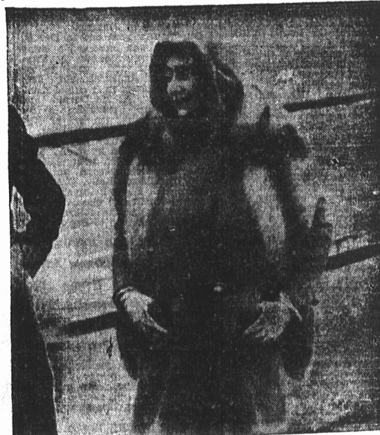
The Commonwealth's Queen bundled up in the handy parka while the Empress of Australia slowly steams through ice floes and fog off Newfoundland.