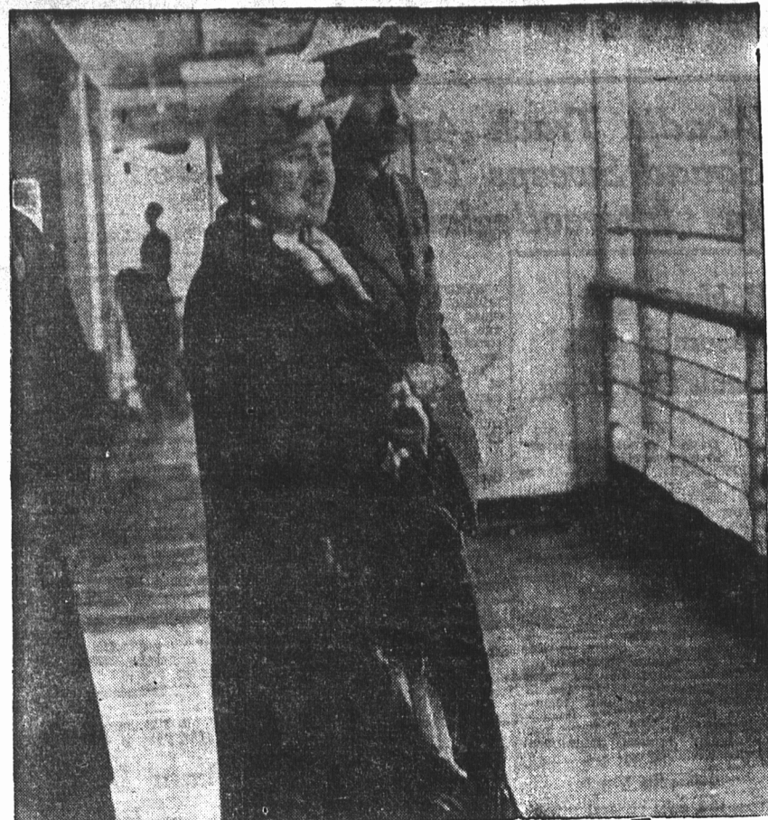
Their Majesties scanning the ice fields that caused a two-day delay in the progress of the Royal ship. A passing berg seems to be holding their attention.