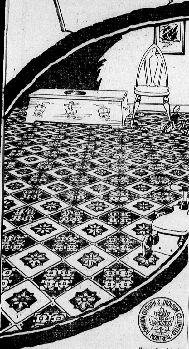
Design illustrated in No. 5242 available in two different colorings

Inexpensive these floors retain their beauty over many long years of hard wear