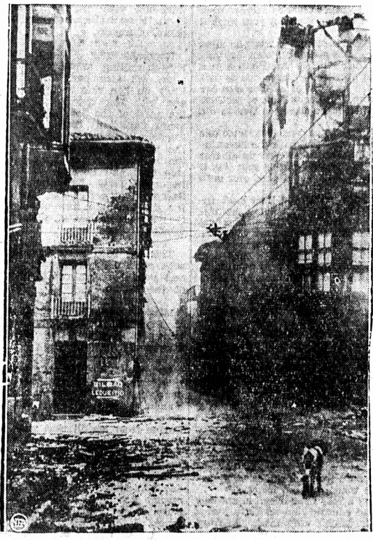
Somewhere down that bomb-riddled street in Guernica, Basque "Holy City," lies this mongrel's home, maybe his master. While destructed roars inexplicably out of the skies, the forlorn pup waits, lonely, bewildered despite while buildings tumble about him. Basques charge that the remorseless air raid over Guernica, with its death-toll of hundreds of civilians including women and children, was the work of German bombers aiding Spanish rebels.