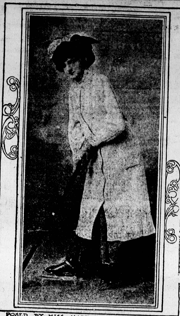
POSED BY MISS MADDEN OF THE 'DOLLAR PRINCESS' CO.

"Miller Bros' big 'stock-taking' sale ends the last day of January. There's still some splendid values in second-hand organs, pianos and sewing machines. A post card will bring you full particulars. Miller Bros., 123 Kent Street, Charlottetown. 1-25-dr-3-1.