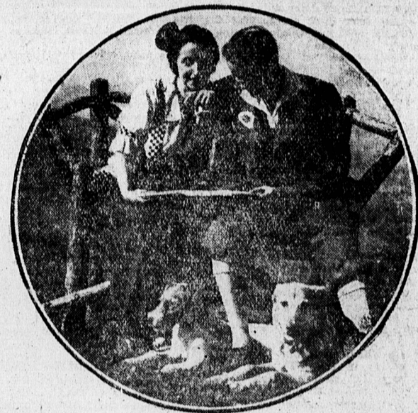
Amelita Galli Curci is seen with her husband at their summer home in the Catskill Mountains. The couple have been resting for the summer prior to the start of a concert tour this fall.