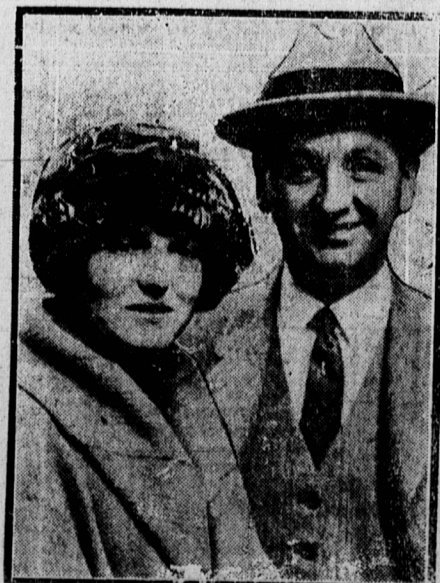
It is Mr. Sol Lesser, well-known film producer, who is responsible for the discovery of Jackie Coogan and the production of his pictures. He is seen with his wife arriving from a recent trip to England.