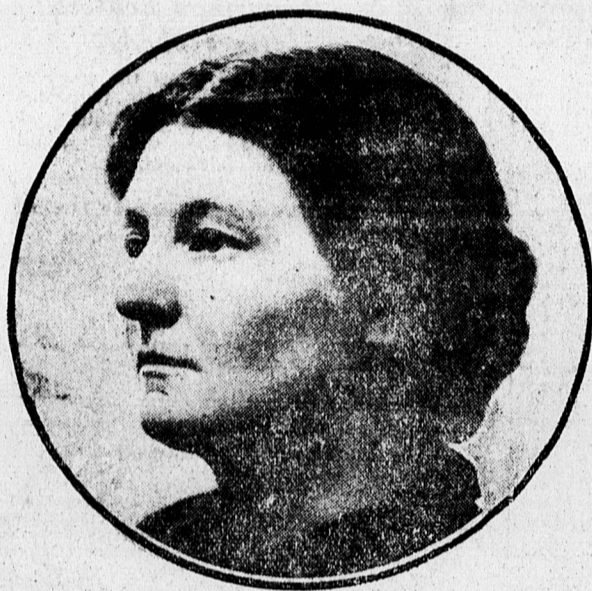
Miss Margaret C. Bondfield was recently elected chairman of the central council of the British trades union congress. She is the first woman to hold this important labor post.