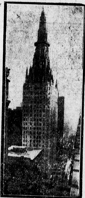
A spire has recently been completed on Chicago's skyscraper church. The structure towers above the other buildings in the vicinity.