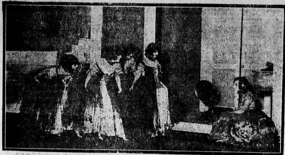
These chorus girls of a popular show recently became interested in the warming up work before a baseball game. Now they have a radio installed in their theatre, and they, too, warm up before each performance.