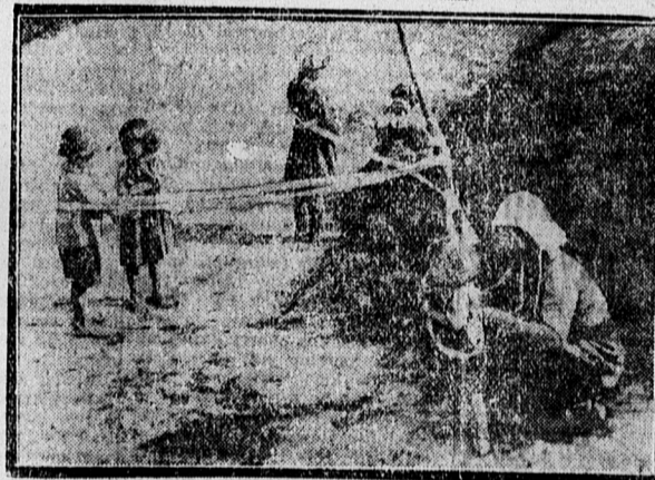
Here's a new method of keeping children from roaming across the road in the path of traffic.