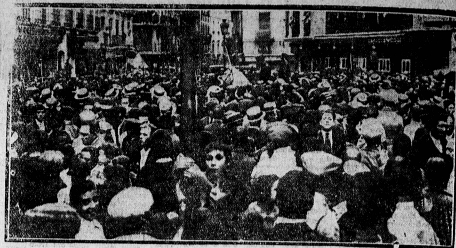
This photograph of Spain's "bloodless revolution" shows soldiers surrounded by an excited crowd, in the streets of Madrid, declaring that the country was "in a state of war".