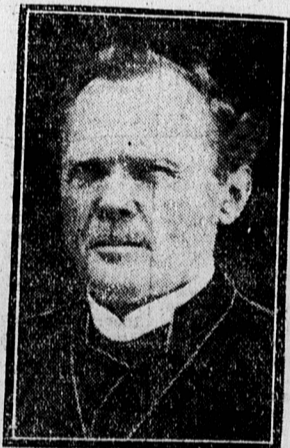
His Grace, Nathan Soederblom, archbishop of Upsala and primate of the Church of Sweden, has recently arrived on this continent to deliver a series of lectures on world peace.