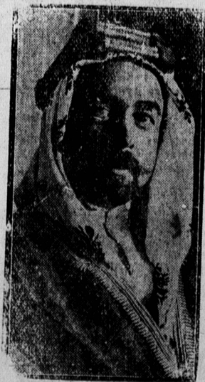
The Emir Abdullah is reported to have suppressed a revolution that broke out against him in Trans-Jordan by his tribesmen.