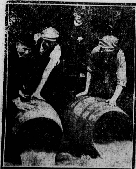
Fifteen barrels of alleged hard liquor were destroyed in Chicago recently as a result of the efforts of the mayor who is determined to make the city dry.