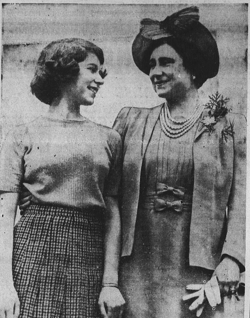
Approved by her majesty, this picture of the Queen and Princess Elizabeth, heir to the throne, has just reached this continent by Clipper. Mother and daughter, a ke—the present Queen and the future Queen of England—are helping to keep British morale high by constantly moving among the people in so many parts taken since war began. The Queen wears the maple leaf emblem which reminds her of the visit to Canada in days before the war.