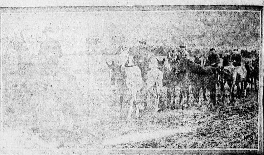
AMERICAN POLO TEAM'S PONIES ARRIVING IN ENGLAND. This photograph shows some of the ponies that will be shown to the American polo team which hopes to bring the international trophy back to the U. S.

HEAD OFFICE WATERLOO, ONT. BEGAN BUSINESS NOVEMBER 23rd 1920 SALIENT FEATURES OF THE FIRST ANNUAL REPORT FOR YEAR ENDING DECEMBER 31st, 1920