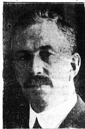
HON. T. A. CRERAR who will represent Canada at Imperial war talks.