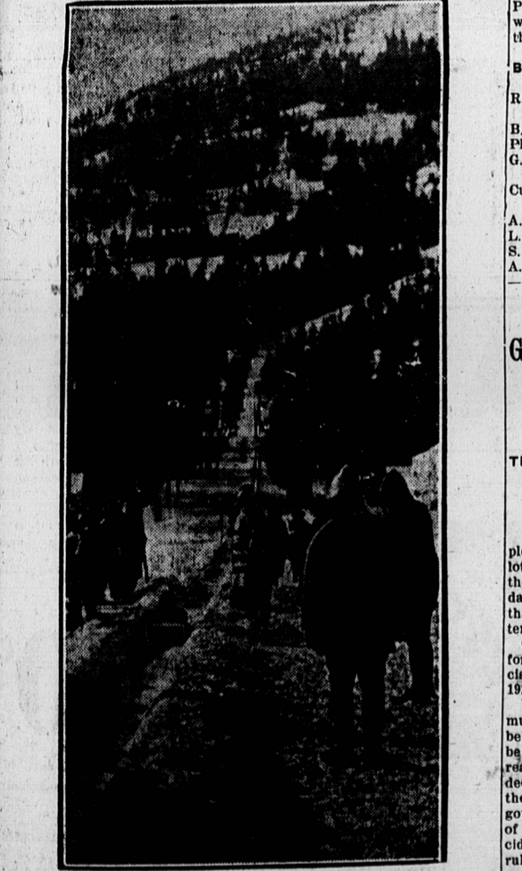
This toboggan slide at Banff will be hard to beat any place in Canada either for distance or its capacity for providing thrills.