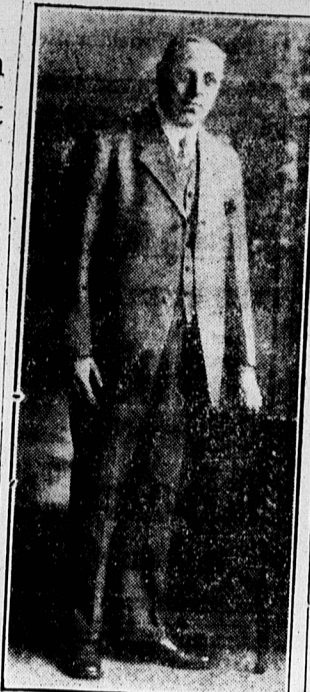
T. W. L. PROWSE, MAYOR OF CHARLOTTETOWN