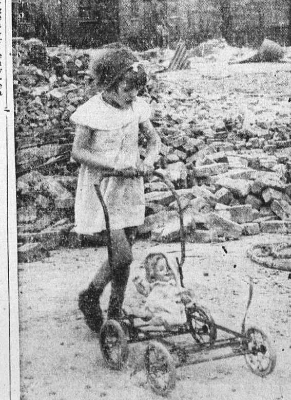
Framed on a background of wreckage and the uprooted remains of an Anderson family shelter, this London child is a pathetic figure amid the desolation that the raiders have left in their wake. Children, as well as men and women, are the victims of Nazi bombing, and to all of them the Queen's Canadian Fund for Air Raid Victims is sending relief and assistance to the limit of its ability. Every dollar subscribed goes through without reduction to the 10 per cent that is to be administered on the spot by those best able to provide for the most urgent cases of need.