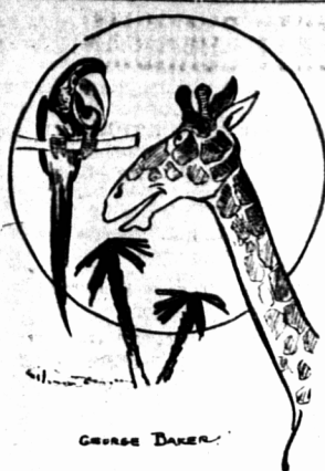
ALL THAT WAS NECESSARY.

The Cockatoo—But I don't see how you ever manage to swallow all that distance. The Giraffe—Oh, I don't bother about swallowing. I trust entirely to the law of gravitation.