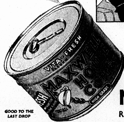
GOOD TO THE LAST DROP