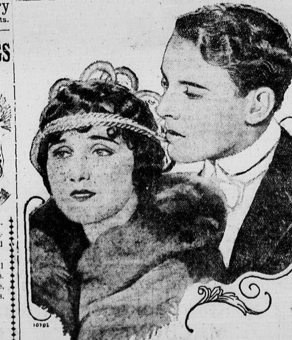
Agnes Ayres and Forrest Stanley in scene from Cecil B. DeMille's Production, "Forbidden Fruit." A Paramount Picture.