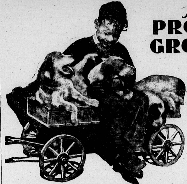
This young lad starts the day right with a nourishing breakfast of Quaker Oats. How proud he is of his pet.

Quaker Oats provides lasting energy for the most active hours of the day