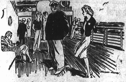
"I've dropped my engagement book overboard." "And now you don't know who you're engaged to." —London Opinion.

Advertising Rates—Payable in Advance Minimum Charge for Any Advertisement 25 Cents. Central Guardian locals, 50 per word; Western and Eastern locals 20 per word; Announcements and Coming Events 30 per word; Classified 30 per word; In Memoriam Notices 70c per name; Lists of Floral and Spiritual Offerings, Cards etc., 50 per name; Letters of Condolence 70c per inch. Wedding engagement 40 words for $1.00 and 10 cents for every additional 3 words. Notices of Thanks and Appreciation, 70c per inch or 40 per name. Lists of Subscriptions 40 cents per inch. Address and Presentation $1.00. Other rates on application.