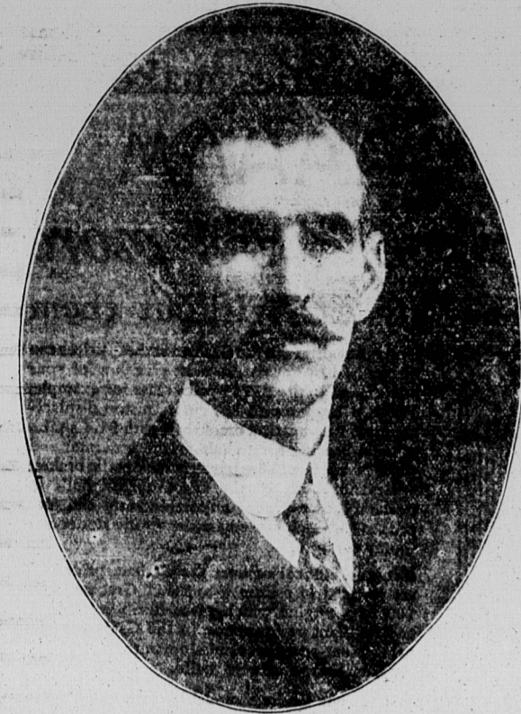
HON. JOHN A. MACDONALD Conservative Candidate for Kings

The budget provided for the following additional allowances and exemptions: