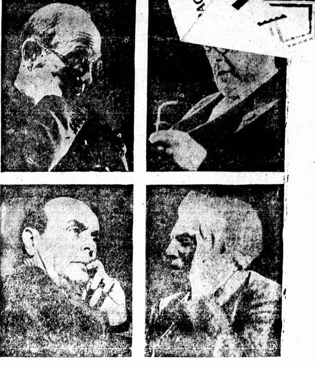
Though casual spectators may be bored by proceedings of the San Francisco Conference, the concentration evidenced above by four leading figures in the parleys is ample evidence of their intense interest.

(By The Canadian Press) OTTAWA, June 7.—End of the war in Europe brought revision of a number of Canada's wartime taxes and studies of others with a view to possible reduction but re-